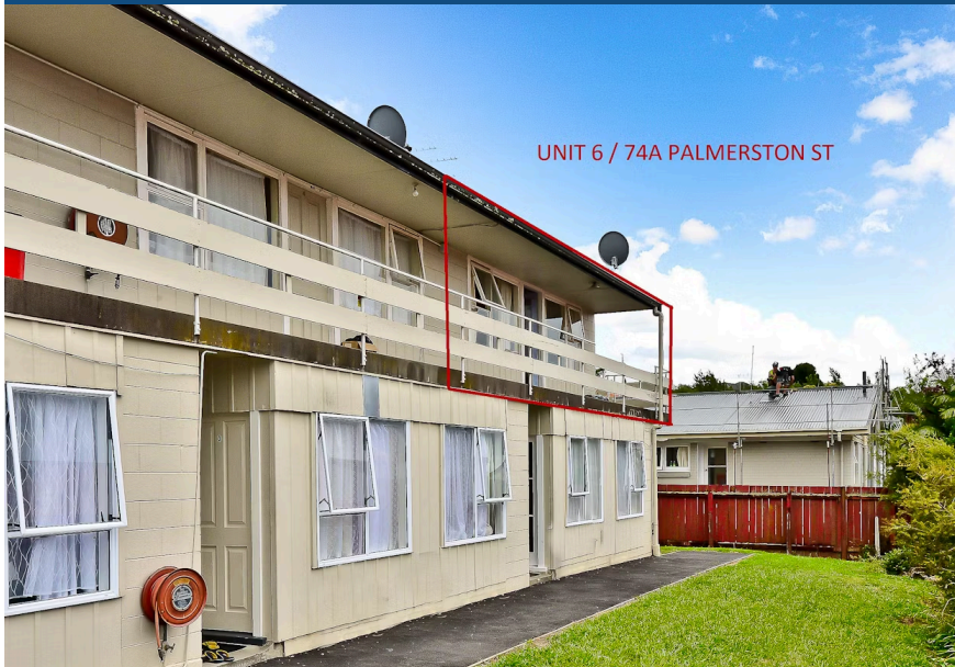
UNIT 6 / 74A PALMERSTON ST