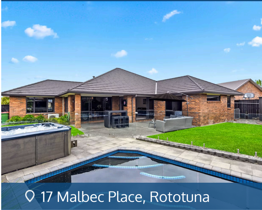
📍 17 Malbec Place, Rototuna