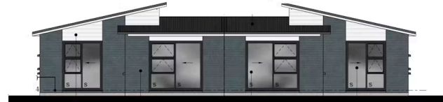
LOT 1 LOT 2 NORTH (REAR) ELEVATION

Turn- Key Package and can be secured with as little as a 5% deposit with the reminder payable upon settlement. Now it's your exciting opportunity to own a super stunning Brand-New Townhouses set in Hamilton's premium Rototuna North location. The construction is already underway and you have an option to choose from 20 upmarket townhouse with its own freehold title. The aesthetic contemporary is featuring internal access garage, 3 bedrooms (ensuite & WIR), 2 bathrooms with tiled showers. Enticing open plan domain is socially encompassing. Stylish well-planned kitchen is functional with balance of beauty, living area has seamless connection to courtyard - perfect space for socialising and entertaining. This smart floor plan is Ideal for small families, busy professional, retirees who value the low maintenance and great for investors to beat the 10-year bright line. Education needs will be well looked after as this property is in top school zone including Horsham Down Primary, Rototuna Junior & Senior High schools. These packages are selling fast - Don't delay being part of this popular community. Call Feroz on 027 2727445 to discuss your options and full information pack.