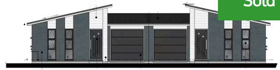
LOT 2 LOT 1 SOUTH (FRONT) ELEVATION