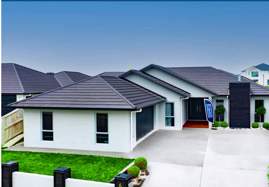
📍 6 Falcon Court, Flagstaff